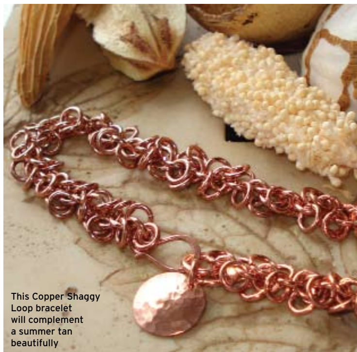
This Copper Shaggy Loop bracelet will complement a summer tan beautifully